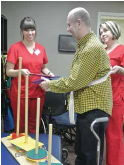
Rehab and Fitness Center